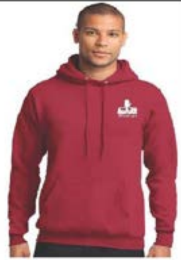
Port & Co Pull-Over Red Hoodie With Screened Design $16.00 Adult 2XL - 4XL - $19.00