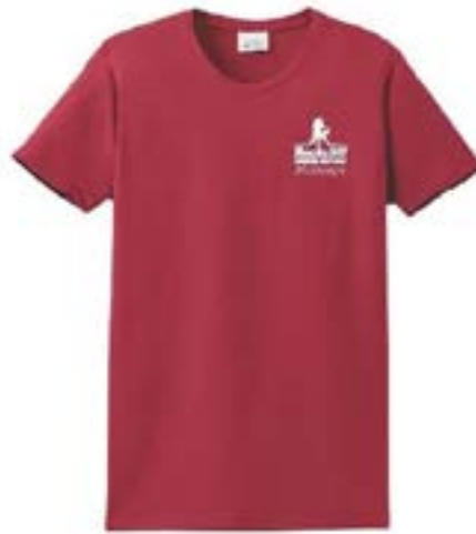
Port & Co Ladies Red Tee With Screened Design $7.00 Adult 2XL - 4XL - $9.00