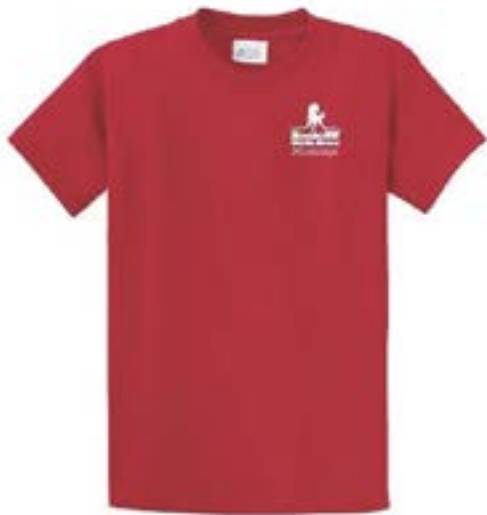
Port & Co Basic Red Tee With Screened Design $7.00 Adult 2XL - 4XL - $9.00